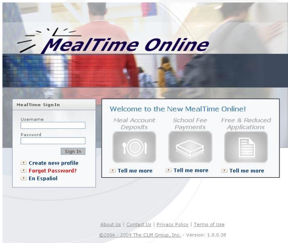
MealTime Online Parent Portal login screen